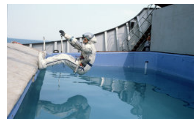
Day-to-Day Life of Baikonur Space Center in Pictures