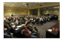
Sun shoots blanks in coverage of gun hearing