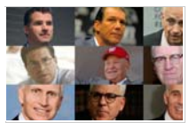
Maryland's billionaires [Pictures]