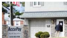
Bel Air payroll company accused in lawsuits of stealing from clients