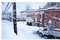
Howard braces for snowstorm